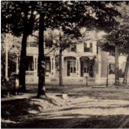
Photo of the Friedman building, at the corner of Court and Broad sts. Was taken decades ago when Broad St. was less traveled. The bright yellow home is on the Historic house Tour set for June 25.